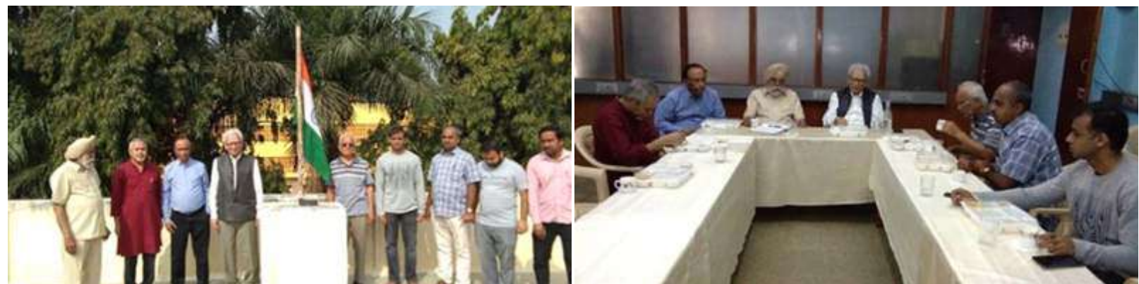
After the Flag Hoisting Chief Guest interacted with IETE members over tea.